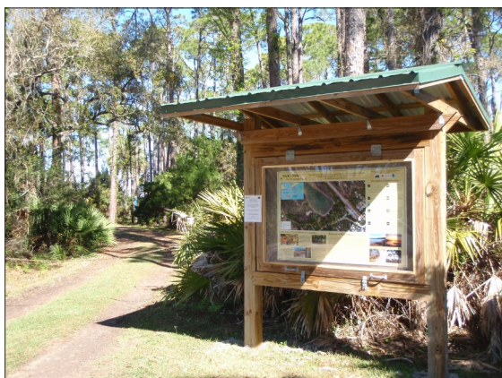
Kiosk at the kayak and camp area entrance.

Nick's Hole consists of about one mile of bayshore and 40+ acres of pine flatwoods, coastal hammock, rosemary-oak scrub and tidal marsh. The property offers a variety of recreational opportunities including kayaking, fishing, hiking, primitive camping, picnicking and wildlife viewing.